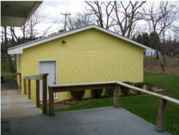
Deck to Garage