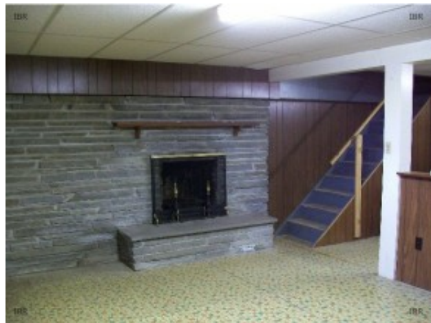
Fireplace in LL