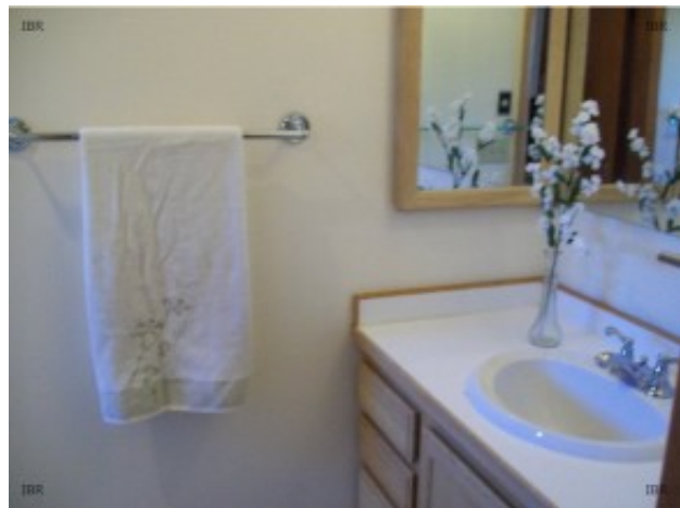
Master bath view 1

Prepared By: Alex Obinatu / WARREN REAL ESTATE ----Information herein deemed reliable but not guaranteed.---- Copyright ©2017 Sun, Mar 5, 2017 13:59 PM