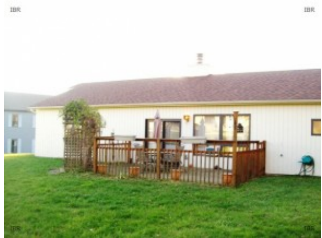
Rear view 2