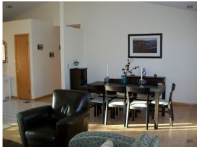
Dining room view 4

Prepared By: Alex Obinatu / WARREN REAL ESTATE ----Information herein deemed reliable but not guaranteed.---- Copyright ©2017 Sun, Mar 5, 2017 13:59 PM