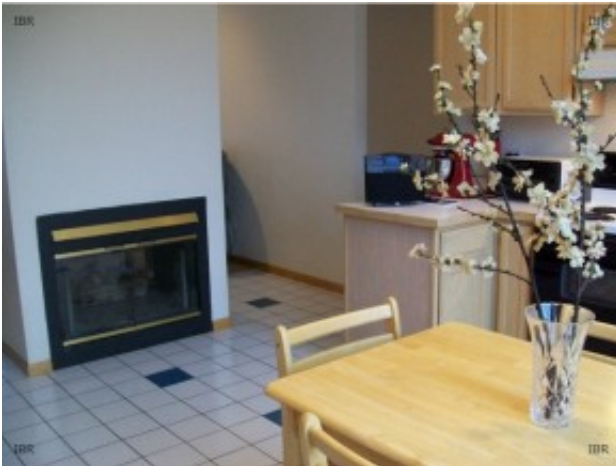
Kitchen view 3