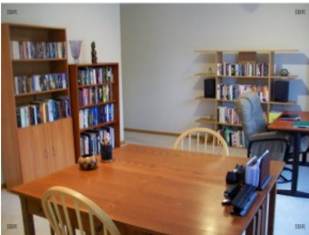
Family room view 2