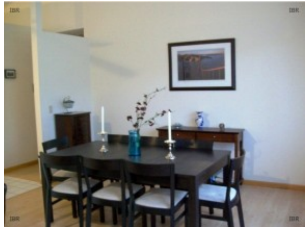
Dining room view 1