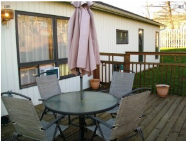
Deck view 2