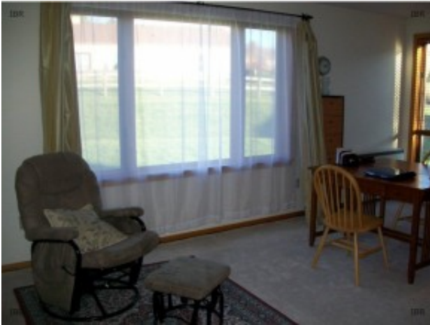
Family room view 4