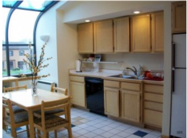
Kitchen view 2