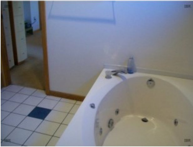
Master bath view 2