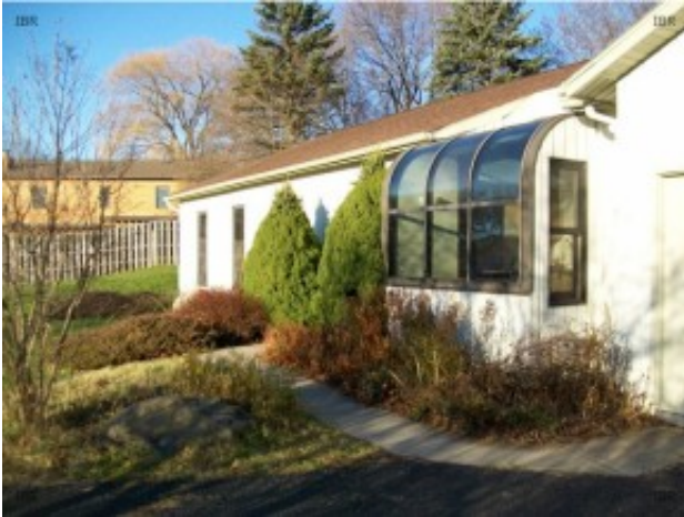
Exterior close-up 2