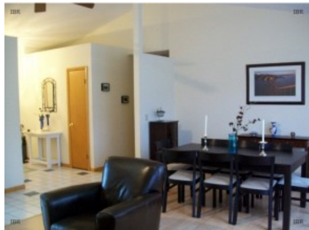
Dining room view 2