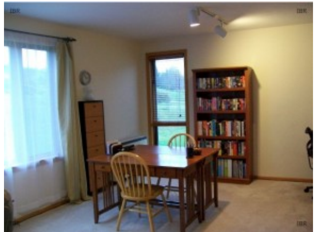
Family room view 1

Prepared By: Alex Obinatu / WARREN REAL ESTATE ----Information herein deemed reliable but not guaranteed.---- Copyright ©2017 Sun, Mar 5, 2017 13:59 PM