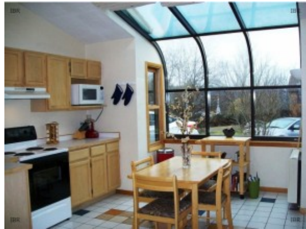
Kitchen view 1