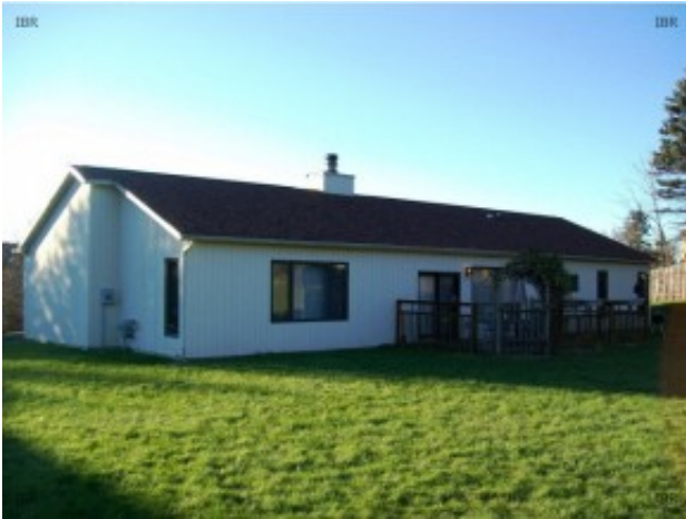
Rear view 1