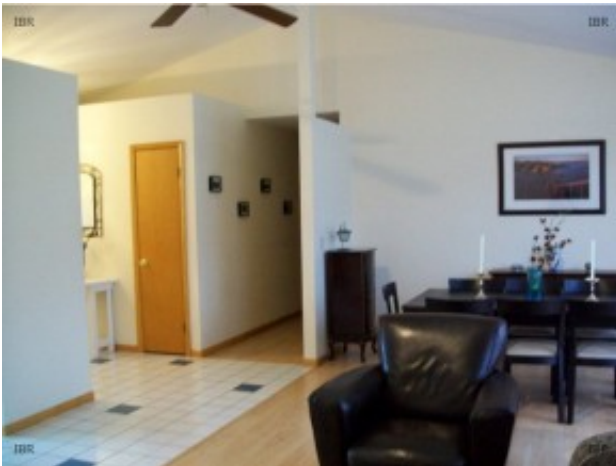
Dining room view 3