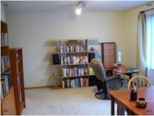
Family room view 3