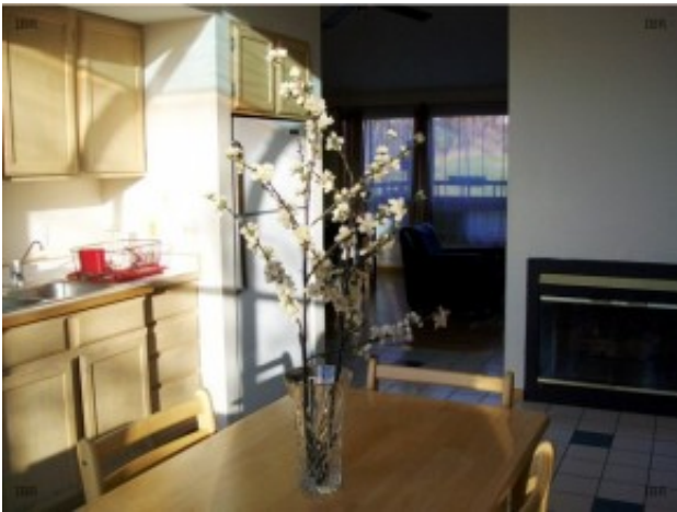
Kitchen view 4