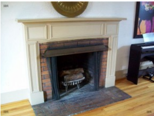
Living Rm Fireplace