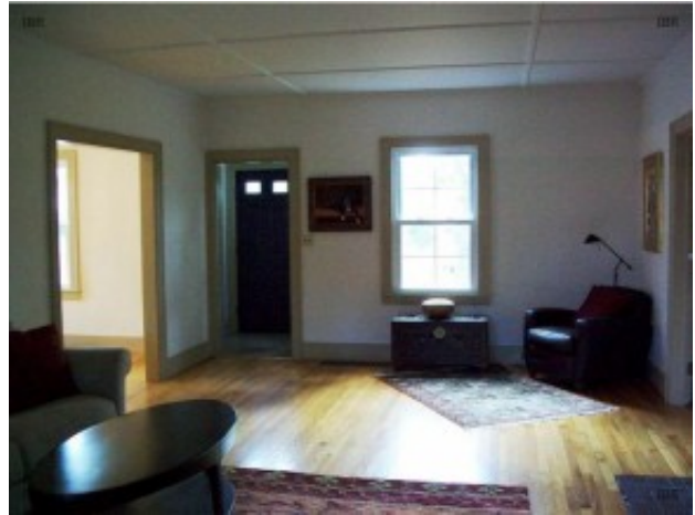
Living Room 3