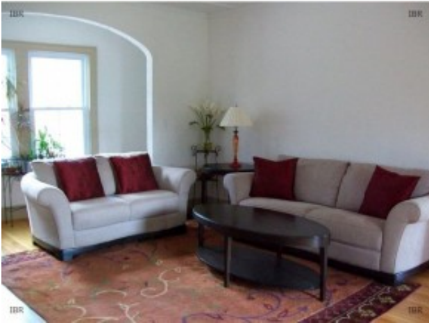
Living Room 2