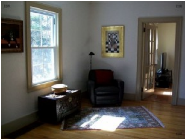
Living Room 4