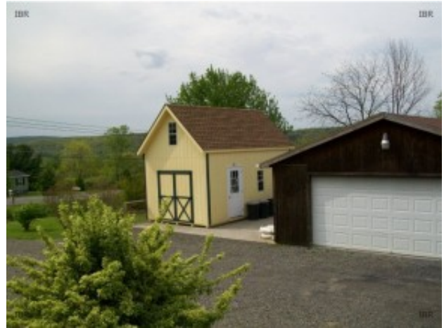
Additional View 4