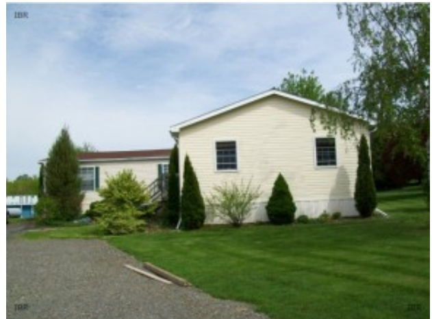
Additional View 2

Prepared By: Alex Obinatu / WARREN REAL ESTATE ----Information herein deemed reliable but not guaranteed.---- Copyright ©2017 Sat, Mar 4, 2017 11:47 AM