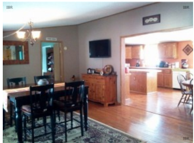
Dining to Kitchen