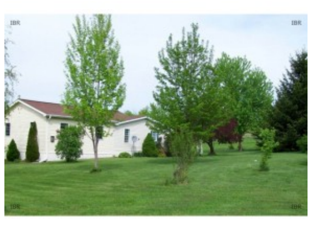
Additional View 6

Prepared By: Alex Obinatu / WARREN REAL ESTATE ----Information herein deemed reliable but not guaranteed.---- Copyright ©2017 Sat, Mar 4, 2017 11:47 AM