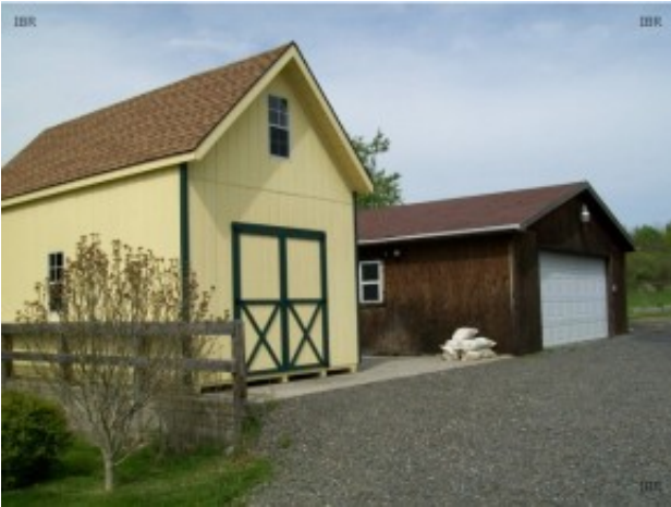
Additional View 3