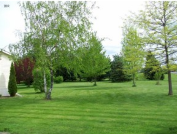
Additional View 5