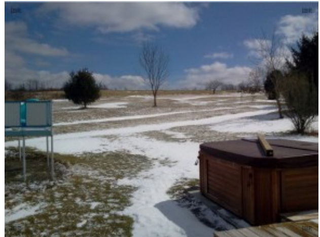
Hot Tub & Yard