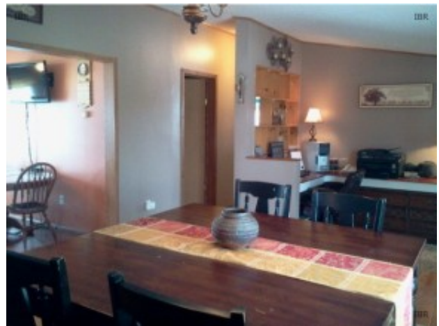
Dining to Office