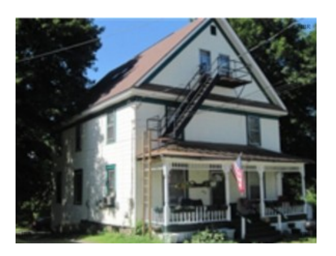
Prepared By: <u>Alex Obinatu</u> / WARREN REAL ESTATE ----Information herein deemed reliable but not guaranteed.----Copyright ©2017 Sat, Mar 4, 2017 12:09 PM