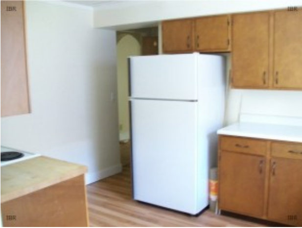
Additional View 6