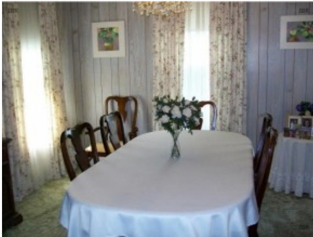
Dining Room Up