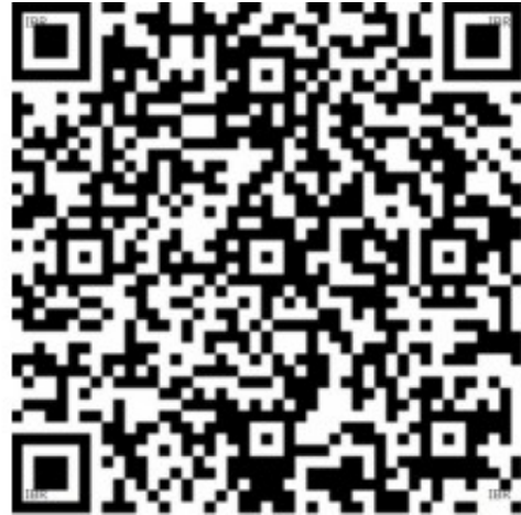
Additional View 5

Prepared By: Alex Obinatu / WARREN REAL ESTATE ----Information herein deemed reliable but not guaranteed.---- Copyright ©2017 Sun, Mar 5, 2017 12:50 PM