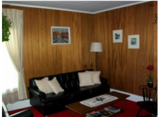
Living Room Up