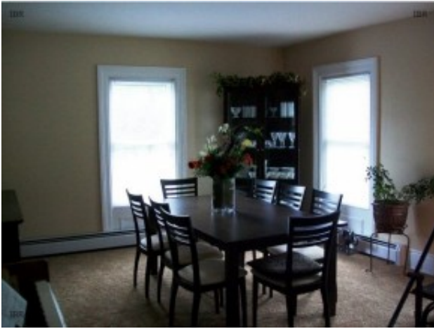
Living Room 2