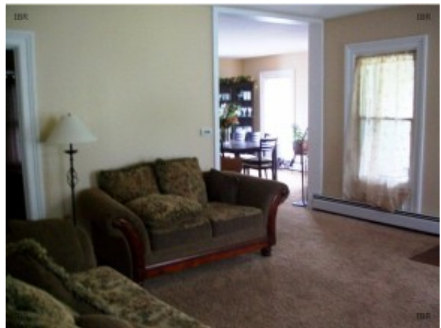
Living Room 1

Prepared By: Alex Obinatu / WARREN REAL ESTATE ----Information herein deemed reliable but not guaranteed.---- Copyright ©2017 Sat, Mar 4, 2017 12:44 PM