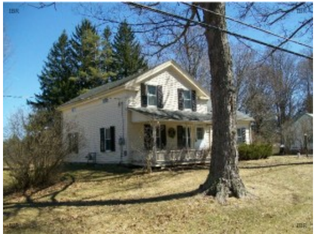
Another front view

Prepared By: Alex Obinatu / WARREN REAL ESTATE ----Information herein deemed reliable but not guaranteed.---- Copyright ©2017 Sat, Mar 4, 2017 12:56 PM