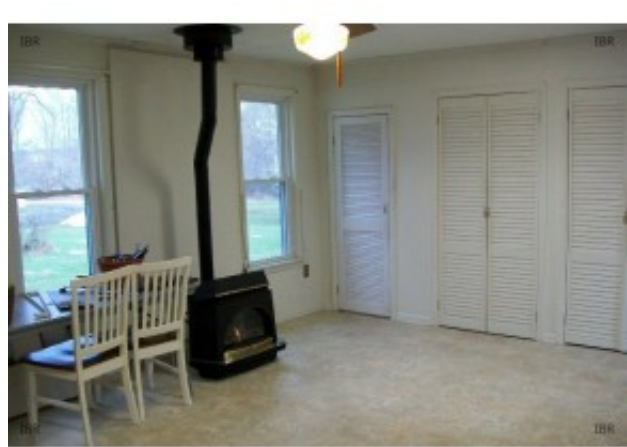
Additional View 2

Prepared By: Alex Obinatu / WARREN REAL ESTATE ----Information herein deemed reliable but not guaranteed.---- Copyright ©2017 Sat, Mar 4, 2017 12:56 PM