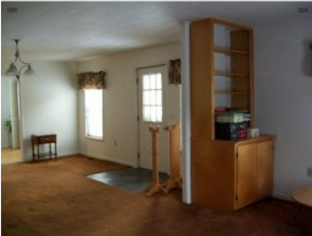
Bedroom - Other