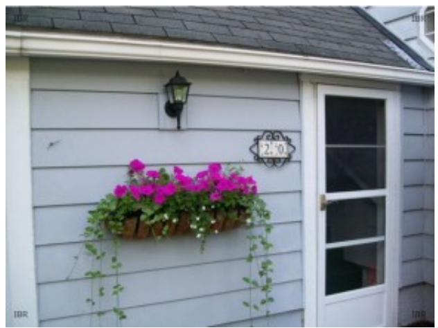
Additional View 2