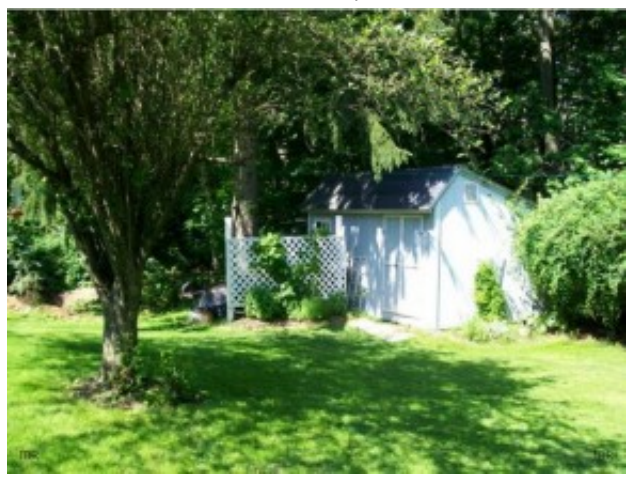
Additional Inside 1