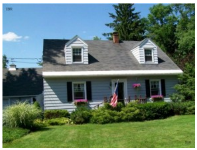
Additional View 5