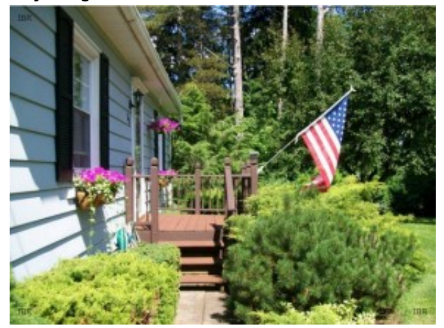
Additional View 3