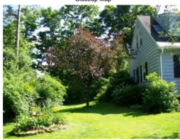
Additional Inside 2