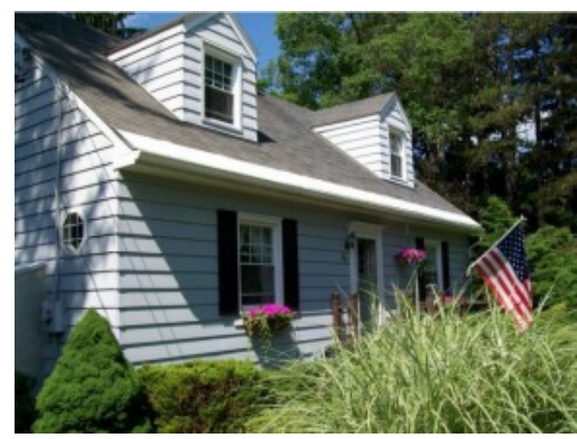
Additional View 4