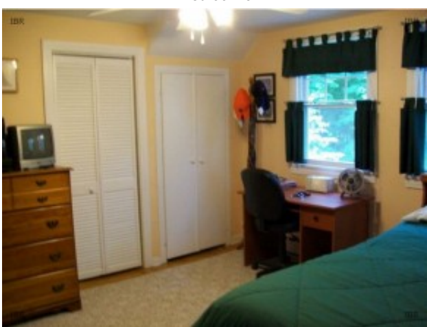
Bedroom - Other