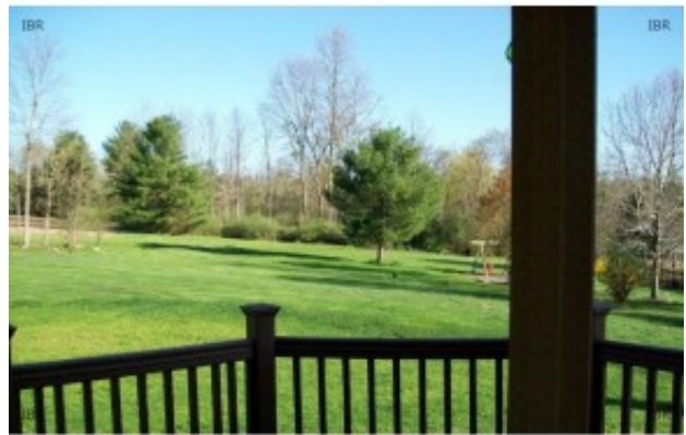
View from Porch

Prepared By: Alex Obinatu / WARREN REAL ESTATE ----Information herein deemed reliable but not guaranteed.---- Copyright ©2017 Sun, Mar 5, 2017 13:46 PM