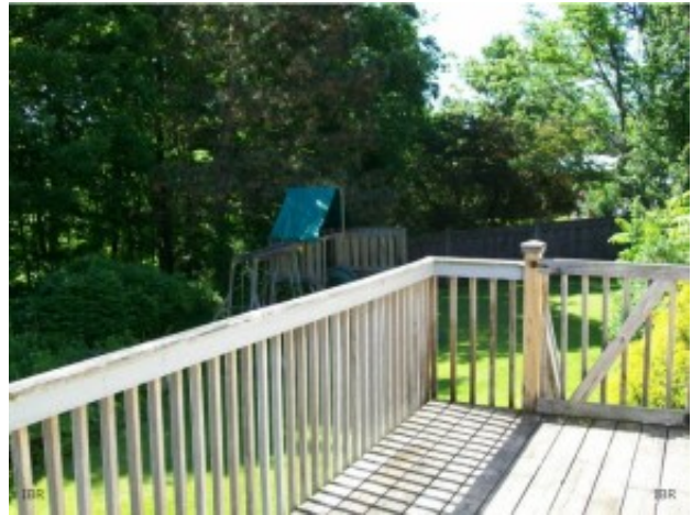
View from Porch