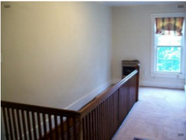
2nd Floor Landing