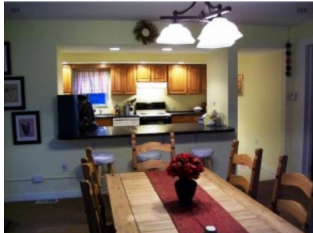
Dining to Kitchen