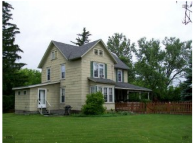
House from Yard