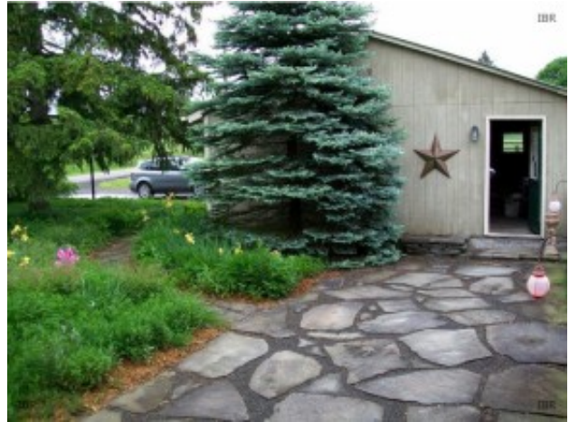
Side Door to Garage