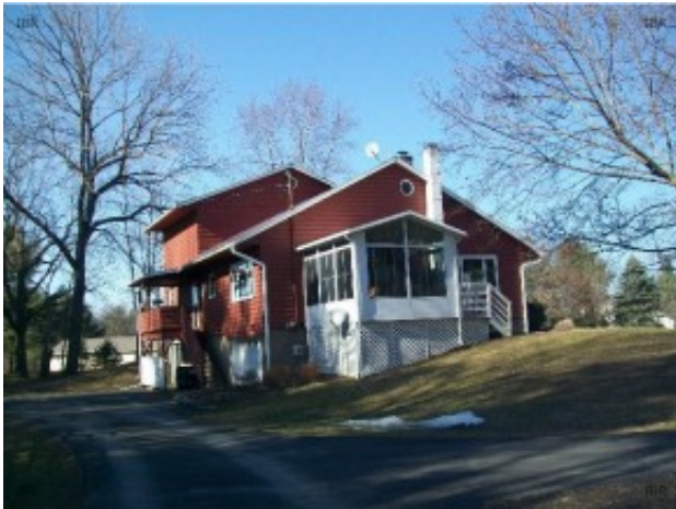
Additional View 4