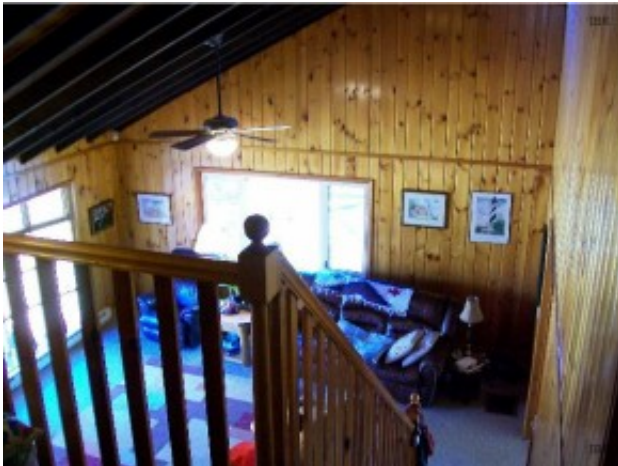
View from Above