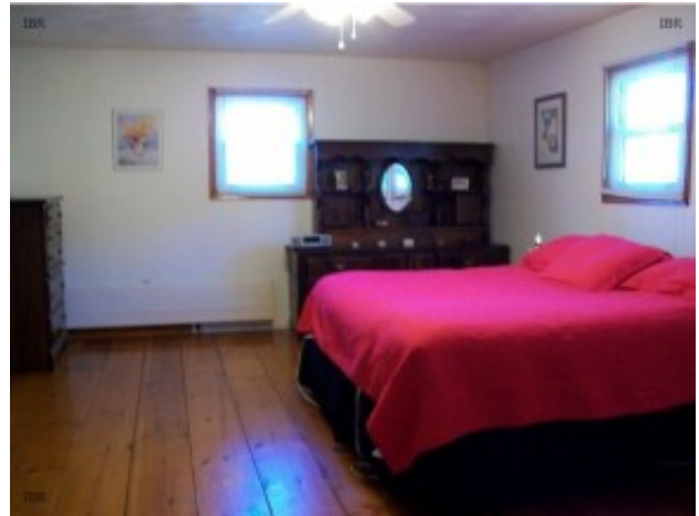
Additional View 6