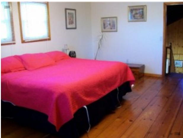
Additional View 5