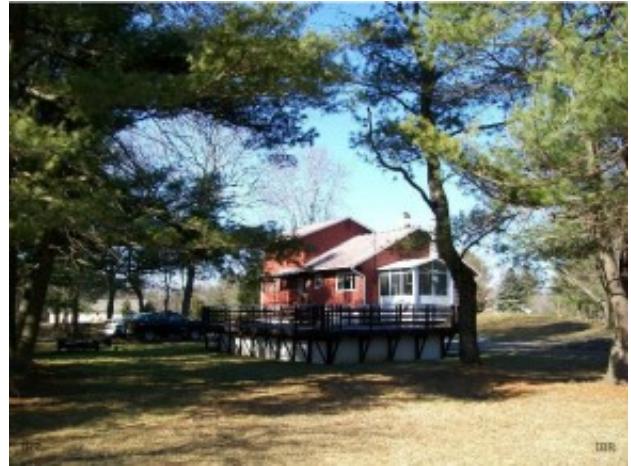
Additional View 3