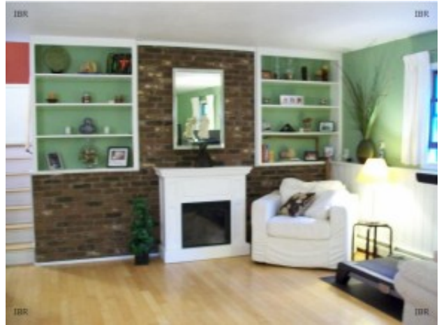
Living Rm & Fireplace