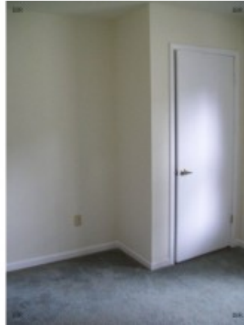
Bedroom 5 Up