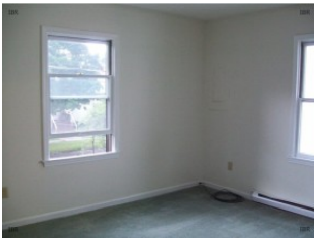
Bedroom 3 Up