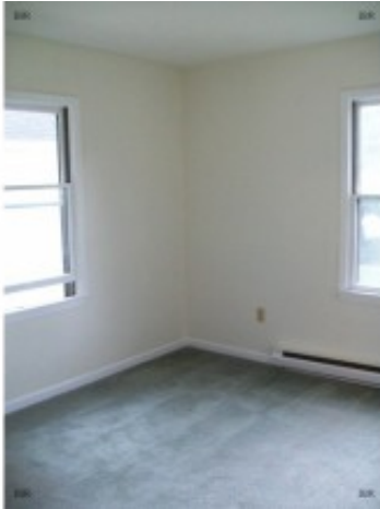
Bedroom 4 Up