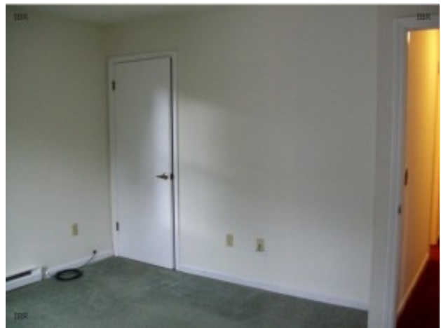
Bedroom 3 Up

Prepared By: Alex Obinatu / WARREN REAL ESTATE ----Information herein deemed reliable but not guaranteed.---- Copyright ©2017 Sun, Mar 5, 2017 9:55 AM