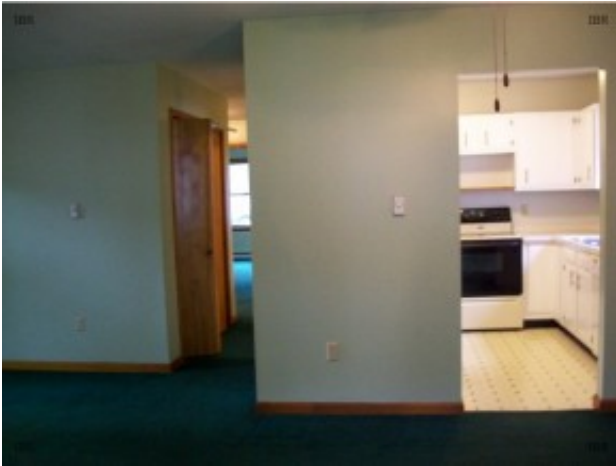
LR to Kitchen Down