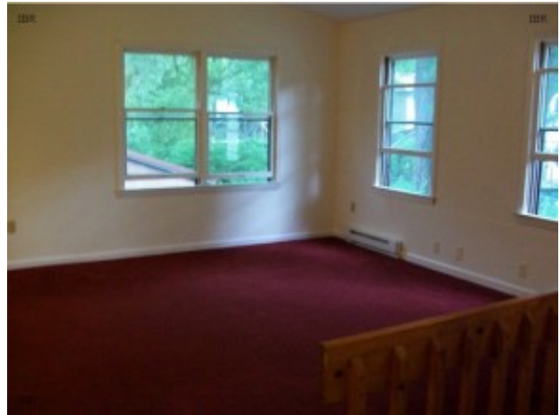
Living Room Up