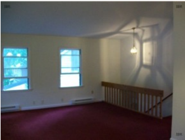
Living Room Up