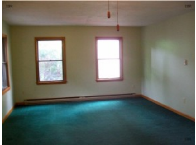
Living Room Down