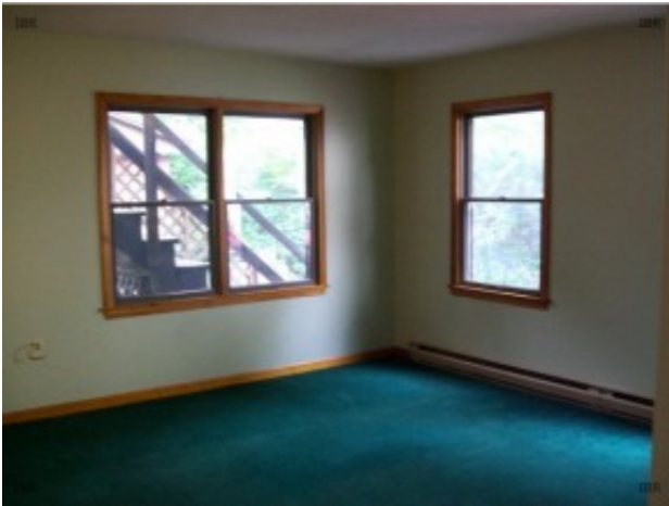
Living Room Down