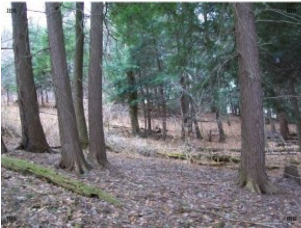
Land View 3