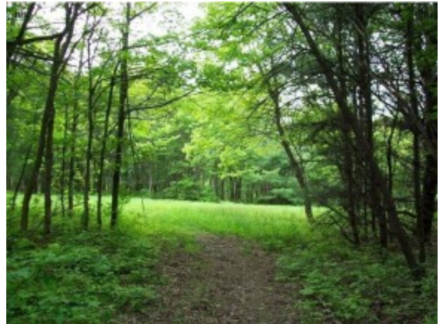
Land View 1

Prepared By: Alex Obinatu / WARREN REAL ESTATE ----Information herein deemed reliable but not guaranteed.---- Copyright ©2017 Sun, Mar 5, 2017 13:33 PM