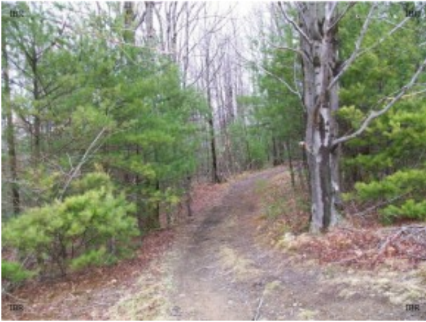
Land View 2