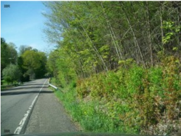
Land View 5