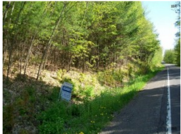
Land View 4