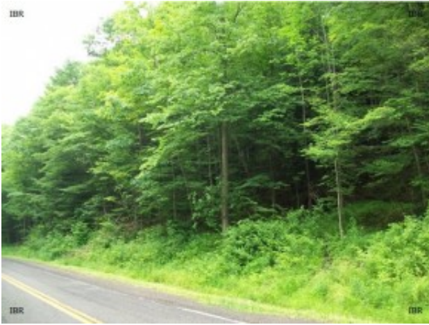
Street View 2