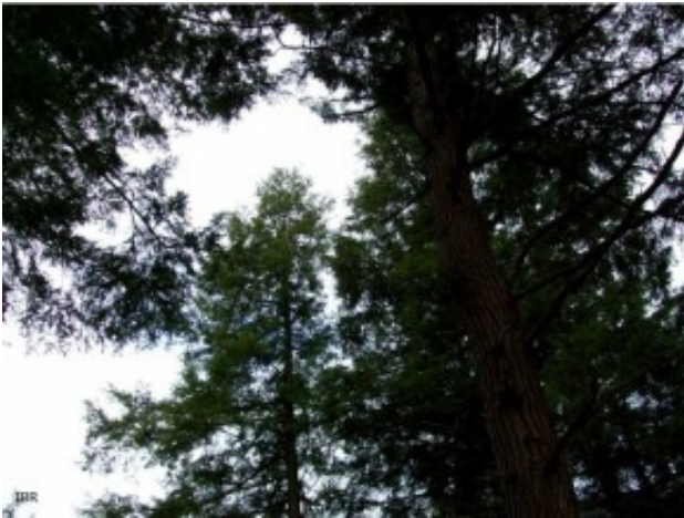
Land View 7