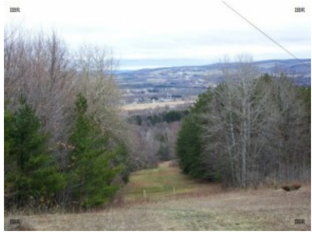
Land View 6